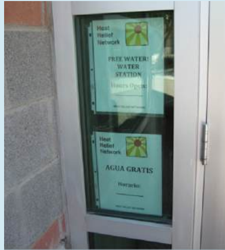
Signs for free water at a cooling center in Maricopa County, Arizona.

A cooling center (or “cooling shelter”) is a location, typically an air-conditioned or cooled building that has been designated as a site to provide respite and safety during extreme heat. This may be a government-owned building such as a library or school, an existing community center, religious center, recreation center, or a private business such as a coffee shop, shopping mall, or movie theatre. Some counties have set up cooling sites outdoors in spray parks, community pools, and public parks. Sometimes temporary cool spaces are constructed for events such as a marathon or outdoor concert.